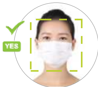
Masked Face Accepted

Wide Dynamic Function, Can Recognize Human Face Under Strong Light