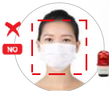
Body Temperature Detected